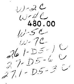
Exhibit A Page 3 of 4